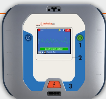
imPulse LCD AND-P05