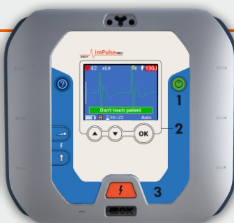
imPulse PRO AND-P01